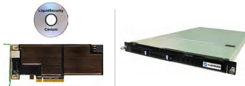
LiquidSecurity CNL35XX Network HSM Family