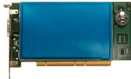
CN11XX-NFB Full Height PCI-X FIPS Acceleration Boards